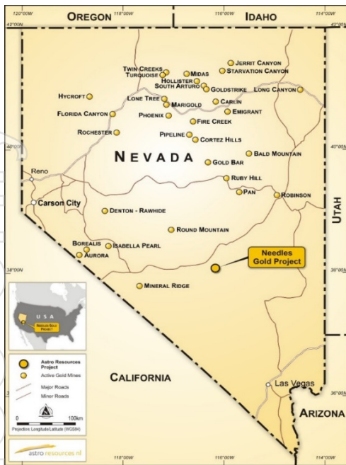
Figure 1. Needles Project location map showing active gold mines

Notwithstanding the fact that no significant gold mineralisation was located at surface, the mapping and sampling indicate that the area has potential to contain sub-surface mineralisation, as it contains tuffs of the right age to act as host rocks, welded tuff and impervious dacite flow units that could act as seals to rising fluids, faults that could act as pathways for rising fluids, and source rocks, the younger felsic intrusives.